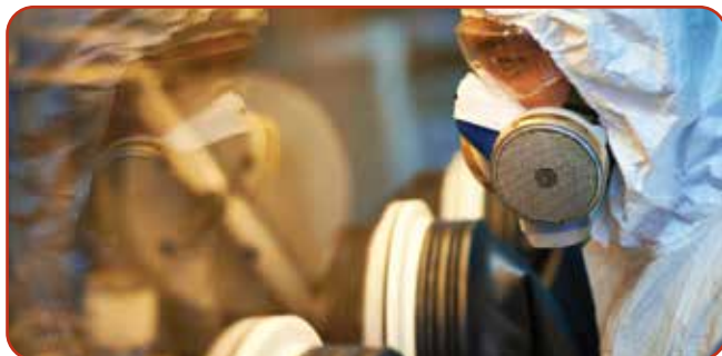
For use in hot box / glove box environments