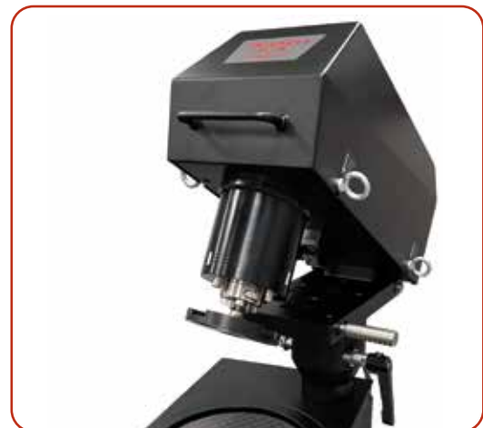
Unique tilt-up feature